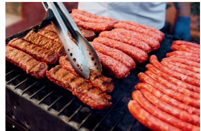
Host a sausage sizzle