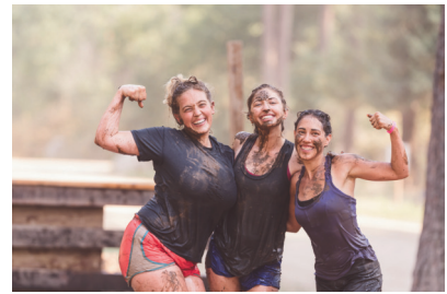
Join an event