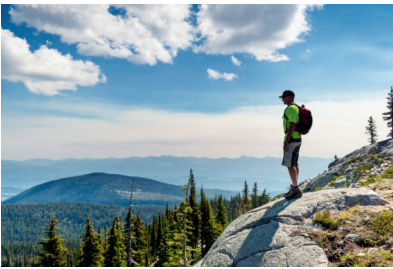
Climb a mountain

If you're having trouble getting started, the following ideas could be a great place to start: