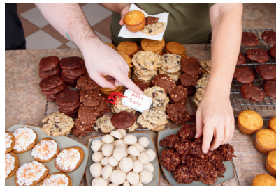
Have a bake sale