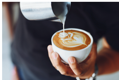
Give something up (coffee, alcohol, technology etc)