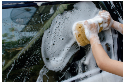
Have a car wash