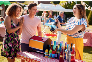
Coordinate a raffle